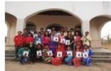
Yam Yuh Krax Gau Daux Meung Ka