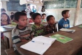
Yam gau ngailai vax daux guang satsana Meung Yom