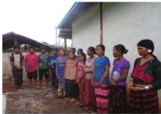
Pui Pa Com Rawm daux Nam Maw Kham