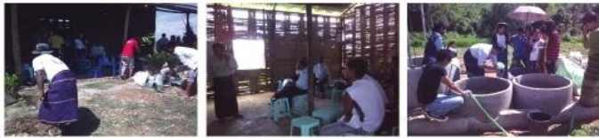
Yam yuh krax sum khaox, krax gau, mai kaing ciied rawm singax Tai Pruh