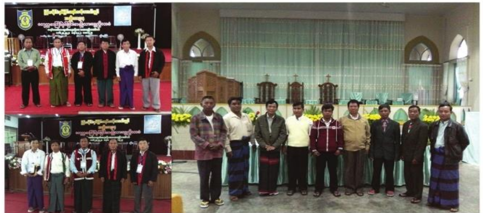
Yam hu daux pawie robrom cubcaw simex MBC (Veng Yangkong)

Viang koe yuh ka mawx kawx, buanson Keeing Siyiex hoik kub son cubcaw simex Numli Vax Kawn Khrit Com Rawm, daux krax pa iak riang kuceu, 2016 num khix phwan (12-15) ngaix, cubcaw simex Numli Vax pon ti hu viex daux pawie robrom ting cubcaw simex MBC bawg (4), (18) kaux, daux veng Yangon, mai pon ti viex daux kaing krub mai kaing robrom kah kum mai kaing krax klieh son pawie an mhawm mhawm heue. 2016 num khix kao (27-29) ngaix, pon khrawm simex daux baux veng khankix (9) kaux, hu daux krax gau "paoh ngai grawng akhuang pa shiang mai kawn pui" (လူ့အခွင့်အရေးဆိုင်ရာ အမြင်ဖွင့်သင်တန်း) daux veng Musie heue. Daux 2017 num cubcaw simex bak ti sang yuh krax gau pa tawx MBC mai krax gau pa lo son simex Vax mai kaing pa rom ti yuh tau mai cubcaw simex MBC heue.