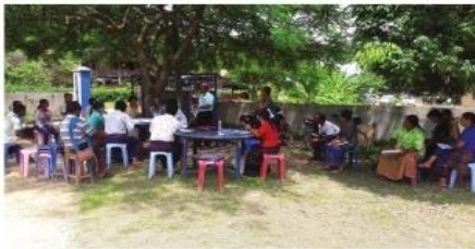
Yam goih ti kah kum (4) cub