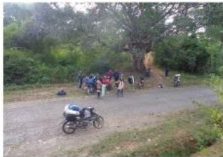
Kaoh Khaing Meung Su, Laig Tang Yan